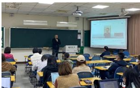
(Lecture at University)